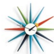
Sunburst Clock, multicolored, Ø 18 1/2"