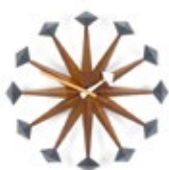
Polygon Clock, walnut, Ø 16 7/8"