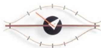
Eye Clock, brass/walnut, H 13 3/8" x W 29 7/8"