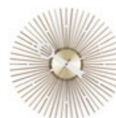
Popsicle Clock , Nussbaum, Ø 350