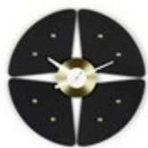
Petal Clock, black/brass, Ø 17 5/8"