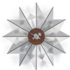
Flock of Butterflies, aluminum, Ø 24"