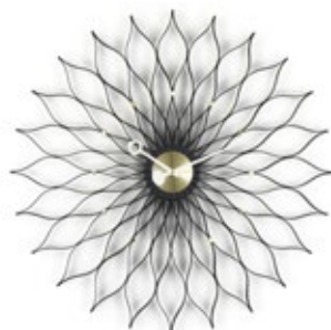
Sunflower Clock, black ash/brass, Ø 29 1/2"