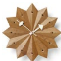
Fan Clock, Kirschbaum (USA), Ø 384