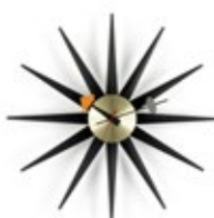
Sunburst Clock, black/brass, Ø 18 1/2"