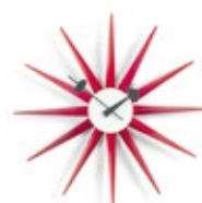
Sunburst Clock, red, Ø 18 1/2"