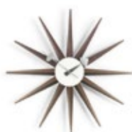
Sunburst Clock, walnut, Ø 18 1/2"