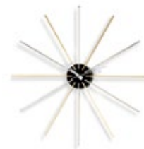
Star Clock, chrome/brass, Ø 24"