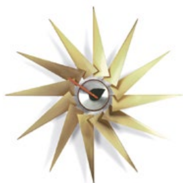
Turbine Clock, brass/aluminum, Ø 30 1/8"