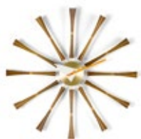
Spindle Clock, aluminum, solid walnut, Ø 22 3/4"