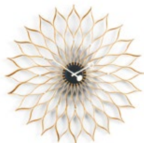
Sunflower Clock, birch, Ø 29 1/2"