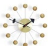
Ball Clock, cherry, Ø 13"